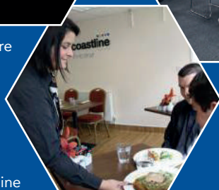
Coastline Coffee Shop