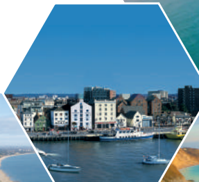
Poole Quay (BCP Tourism)