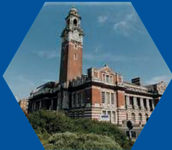
Bournemouth Campus: The Lansdowne, Bournemouth, Dorset, BH1 3JJ, United Kingdom.