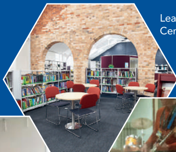
Learning Resource Centre